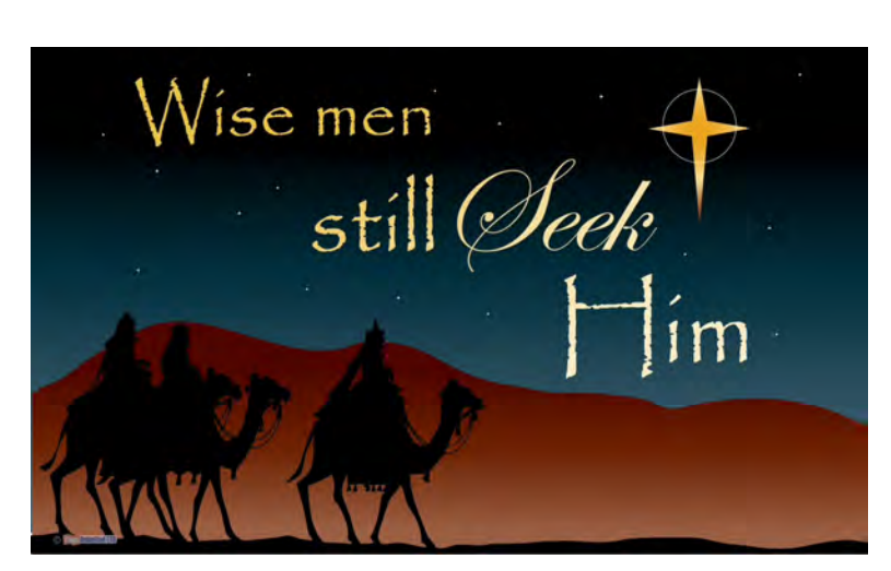
Be of God - Live of God - Act of God