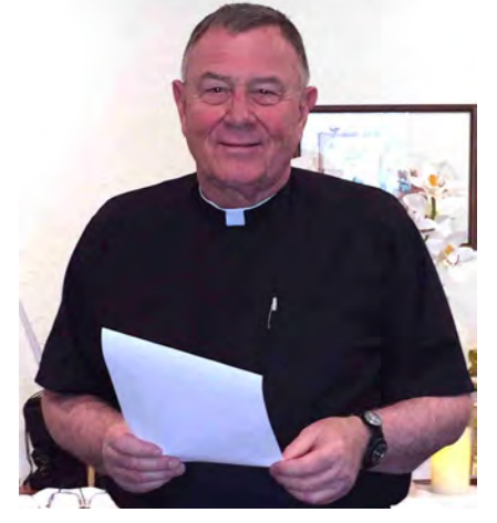
must recognize Him!

Even the politically correct BCE - CE (that is to say, Before Common Era and Common Era) divides time at the birth of our Lord. Even those who fall in that trap