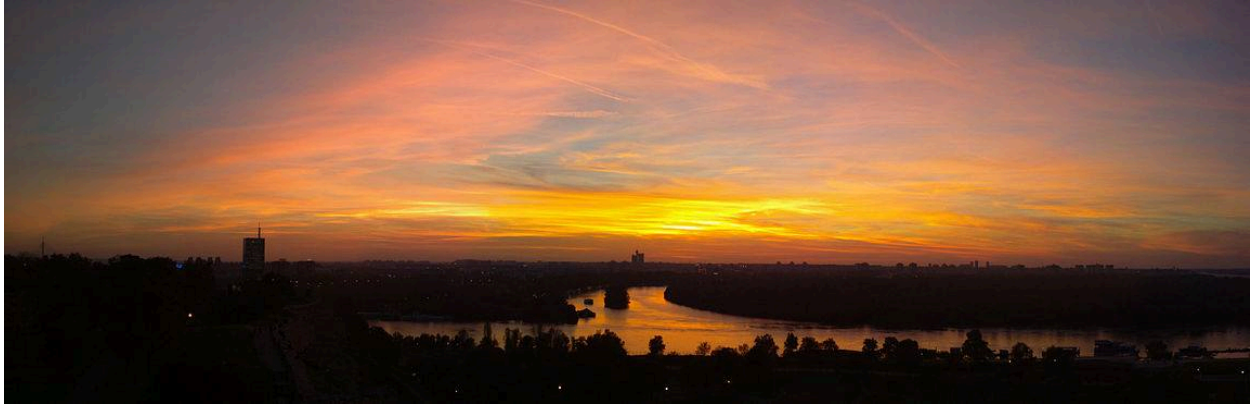
Belgrade – confluence of Sava and Danube Rivers last night