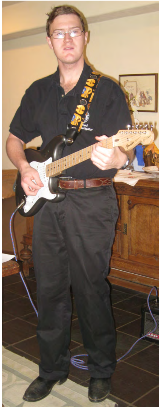
Bishop Thomas Cranmer, the first

Each Sunday there are Propers: special prayers and readings from the Bible. There is a Collect for the Day; that is a single thought prayer, most written either before the re-founding of the Church of England in the 1540s or written by