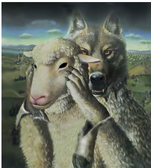
The first day of Lent, commonly called Ash Wednesday. The Collect.

A LMIGHTY and everlasting God, who hatest nothing that thou hast made, and dost forgive the sins of all those who are penitent; Create and make in us new and contrite hearts, that we, worthily lamenting our sins and acknowledging our wretchedness, may obtain of thee, the God of all mercy, perfect remission and forgiveness; through Jesus Christ our Lord. Amen.