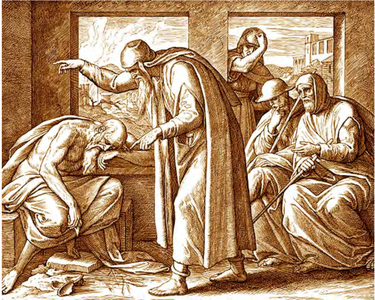
The First Sunday in Advent The Collect.

A Lmighty God, give us grace that we may cast away the works of darkness, and put upon us the armour of light, now in the time of this mortal life, in which thy Son Jesus Christ came to visit us in great humility; that in the last day, when he shall come again in his glorious majesty to judge both the quick and the dead, we may rise to the life immortal, through him who liveth and reigneth with thee and the Holy Ghost, now and ever. Amen.