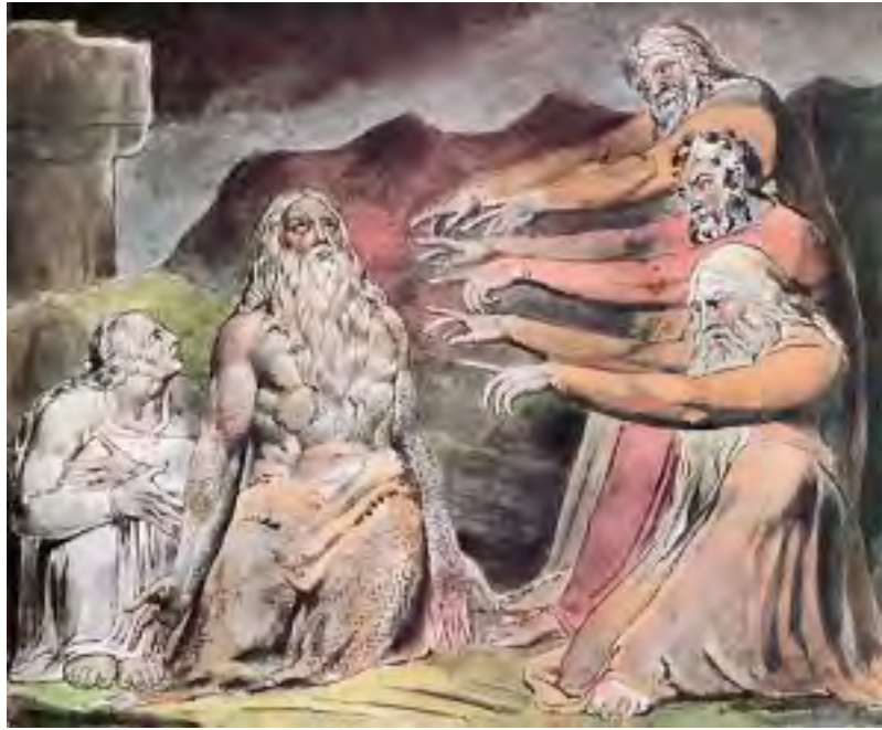
Saint Andrew, the Apostle The Collect.

A LMIGHTY God, who didst give such grace unto thy holy Apostle Saint Andrew, that he readily obeyed the calling of thy Son Jesus Christ, and followed him without delay; Grant unto us all, that we, being called by thy holy Word, may forthwith give up ourselves obediently to fulfil thy holy commandments; through the same Jesus Christ our Lord. Amen.